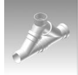
SDR 35 GSH