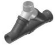
SDR 26 GSH