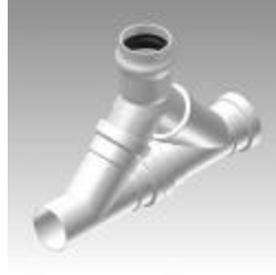
SDR 35 GSG