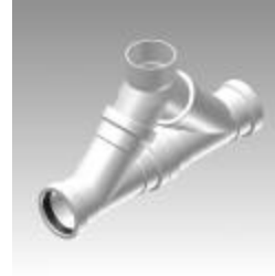
SDR 35 GGH