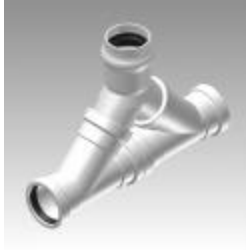
SDR 35 GGG