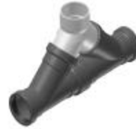
SDR 26 GGH