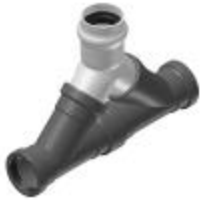
SDR 26 GGG